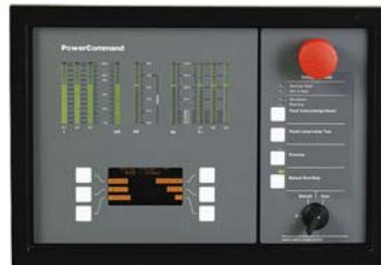
Optional features shown